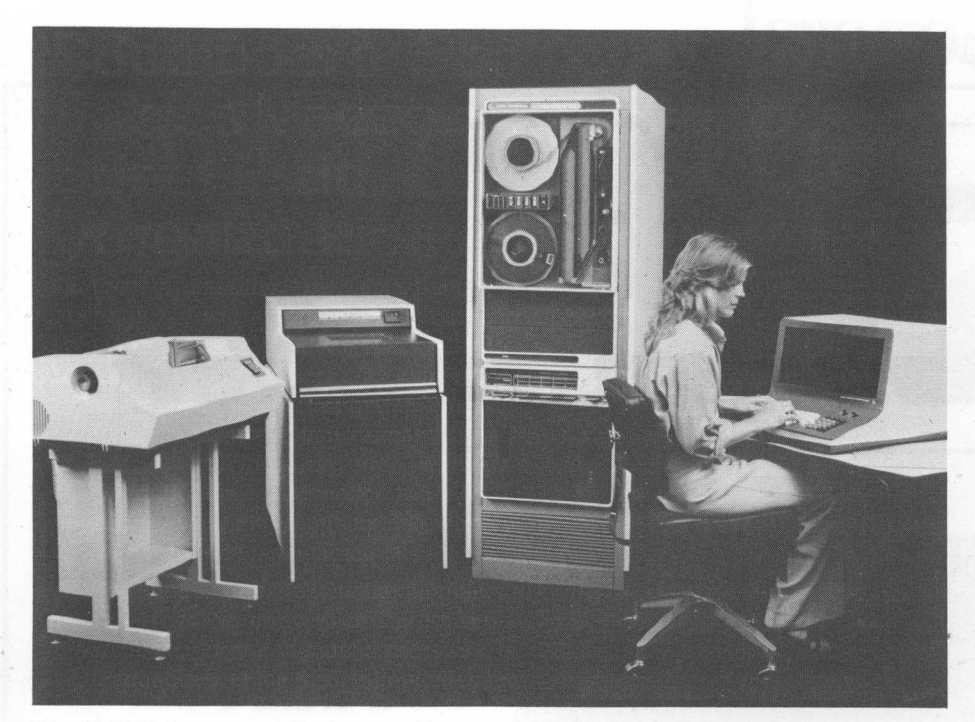
The ECLIPSE computer is featured here in a typical systems environment.