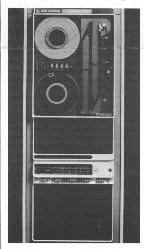
ECLIPSE equipment will be operational at the New York City and London press conferences.

The New York introduction at the Four Seasons Restaurant introduces ECLIPSE to the United States and Canadian press. Over 60 trade press