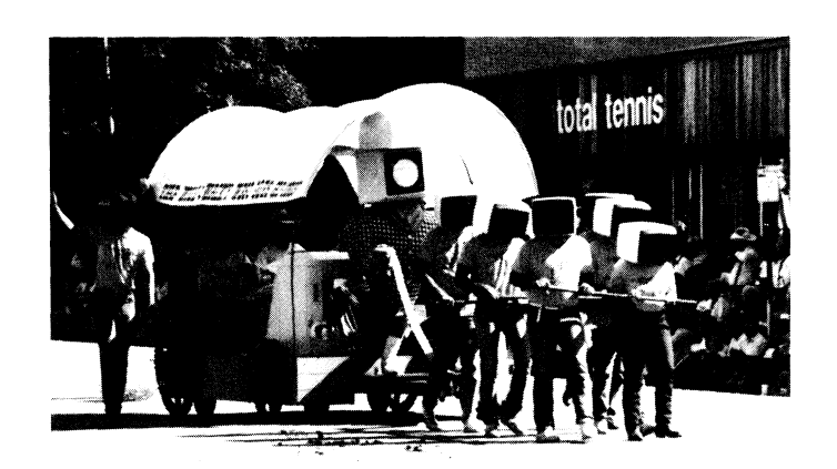
Data General's float stole the show at the annual Colorado Springs Pikes Peak or Bust Rodeo Parade.

Data General's float entry in the annual Colorado Springs Pikes Peak Or Bust Rodeo Parade was awarded the Governor's trophy (first place in merit) at a parade held last month. The theme of this year's parade was the "Wild and Wacky West." Data General's float fit the category perfectly, with six "terminal head" people pulling a covered wagon. On the wagon a campfire scene was portrayed, with three cowboys sitting around a campfire. Only this campfire was a special effects fire, and the cowboys were serenaded by three DATA GENERAL/One computers, generating computer renditions of "She'll Be Coming Around The Mountain When She Comes" and "Skip To My Lou." In addition to the music, the DATA GENERAL/Ones ran a graphics software program, which displayed the parade's theme, followed by Data General's name and logo. The program also featured a drawing of the float itself, as the terminal heads pulled the float across a mountain backdrop.