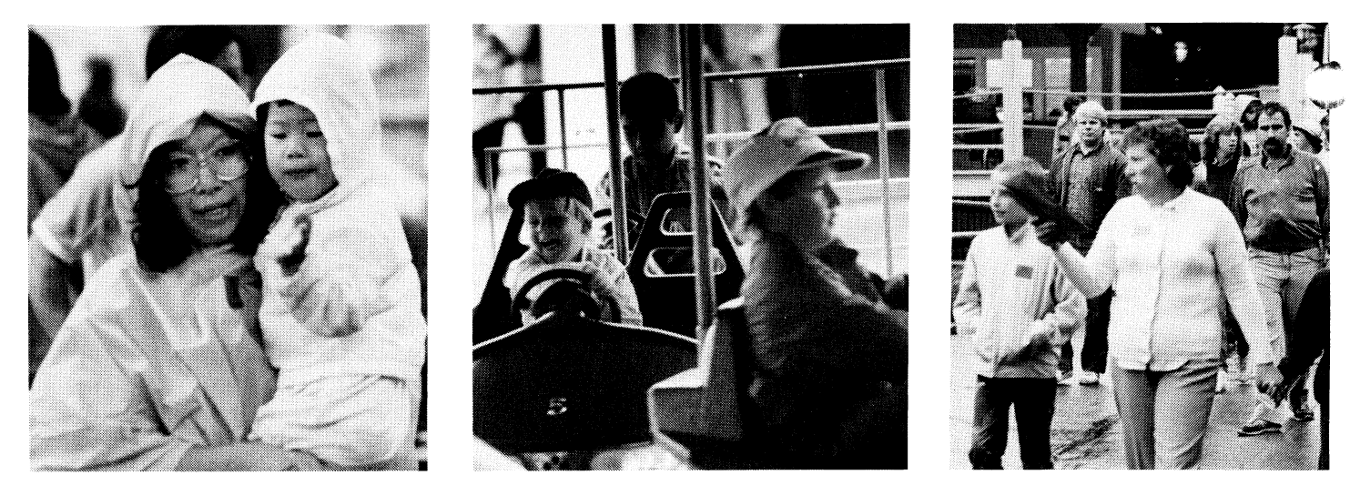
Last weekend's company outing to Canobie Lake Park in Salem, N.H. attracted more than 1000 employees and their guests. Rainy weather did not dampen their spirits as the group enjoyed unlimited rides and a barbeque lunch.