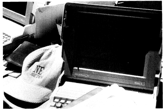
DATA GENERAL / One Model 2 portable computers sit atop a folding table in the sun of Woods Hole during preparations for WNEV-TV's live news broadcasts, the final stop in the Boston station's five-week news tour throughout New England.

connections, huge satellite equipment and mobile video control booths. "People were impressed. They hadn't seen anything like it."