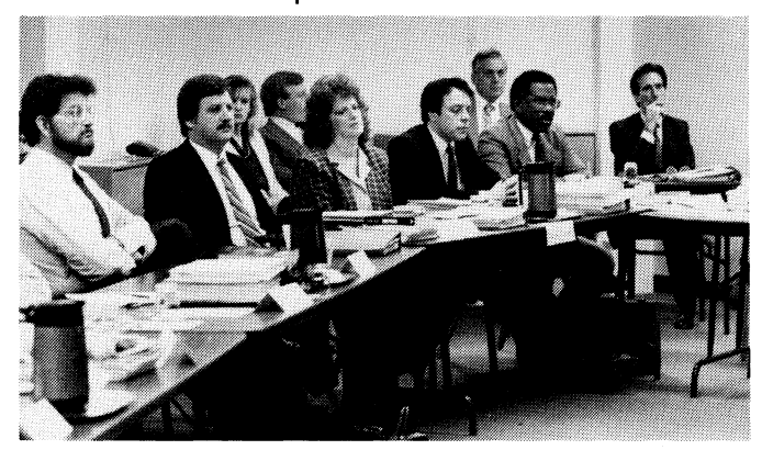
Employees take part in the recent Advanced Management Course, offered by Corporate Management and Organizational Development.

M.O.D. continues to expand its course offerings available to managers. For more information on these seminars or any M.O.D. course, contact Corporate M.O.D. at extension 6958 in Westboro or your divisional M.O.D. representative.