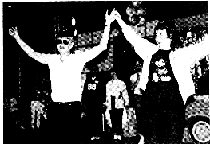
A contest for the most authentic '50s outfit was held as part of a Data General-weekend in Orlando, Florida. The trip was conducted in appreciation of employees' 10 years of company service.

More than 400 employees from Data General locations across the United States last weekend visited Walt Disney World to celebrate their 10-year service anniversaries with Data General.