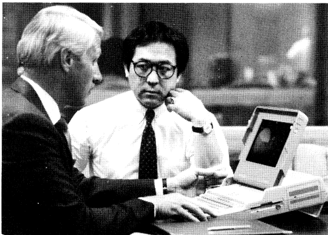
The DATA GENERAL/One Model 2 computer is the only laptop which is fully integrated within its own office automation environment, making it a remote workstation for departmental computing applications.

For federal users, the Model 2 offers an outstanding combination of technology and cost-