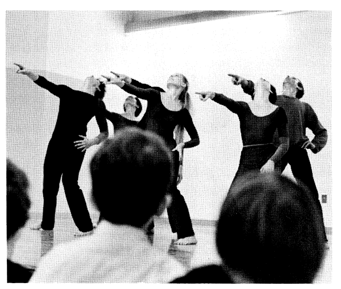
Pupils in Milford Public schools recently learned about the world of dance and music, in a Data General-sponsored program by the Concert Dance Company of Boston. The company regularly supports schools and non-profit organizations in communities where employees are located.

Data General helped the Central Massachusetts' Regional office of the Massachusetts Society-For The Prevention Of Cruelty To Children purchase and renovate a house for abused and neglected kids.