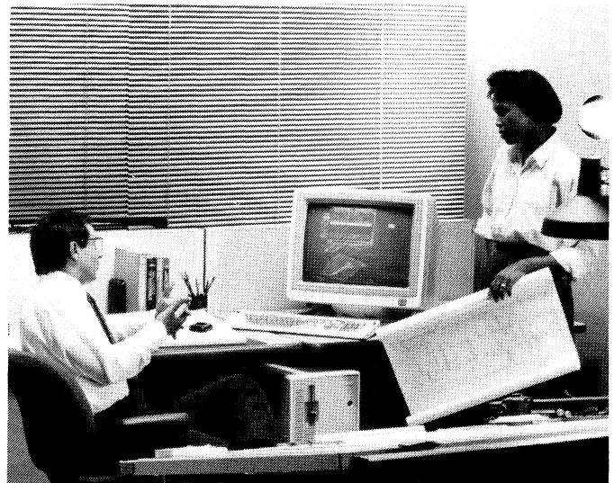
Data General's new DS/7500 distributed engineering workstation combines high-performance graphics and compact, under-the-desk packaging. The DS/7500 is well-suited for architecture, engineering and construction applications.

Analysts also believe the new engineering workstations are likely to give sharp new competition to Apollo Computer and Sun Microsystems.