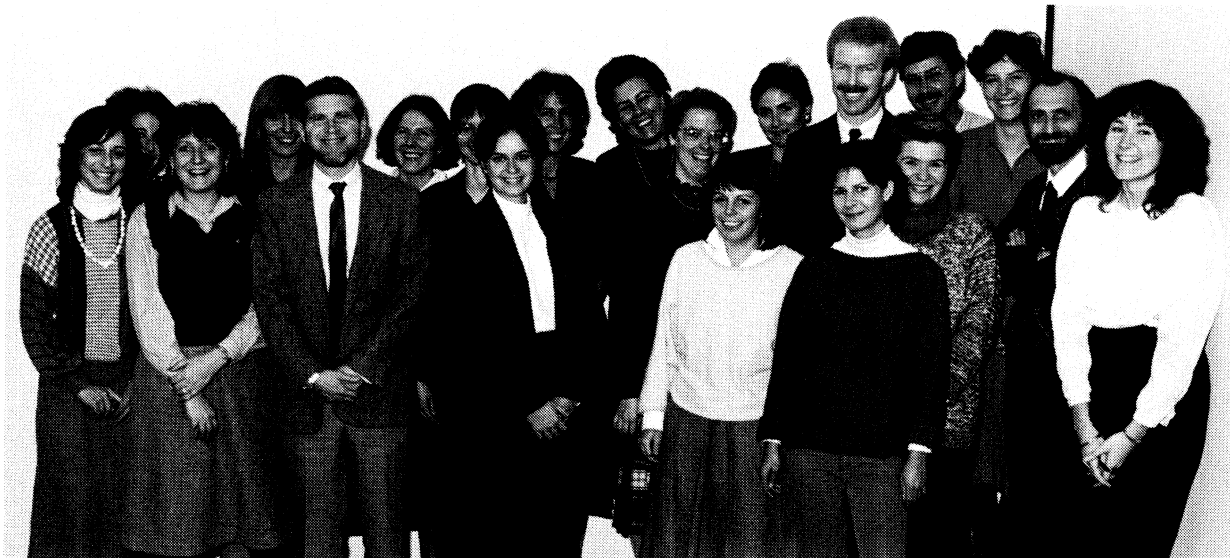
The International Software and Documentation (IS&D) group produces Data General software in five different languages, including French, German, Italian, Spanish and Swedish.