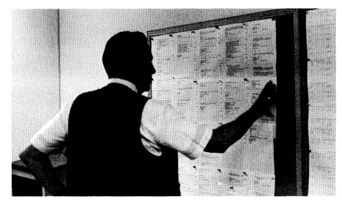
Among the resources available to employees affected by the workforce reduction is a bulletin board listing of jobs. More than 1000 job openings for more than 100 companies are posted.

The Placement Support Center serving affected annihologies from Milford, Southboro and Westboro is located at 2400 Computer Drive, adjacent to Buildings 14A and 14B.