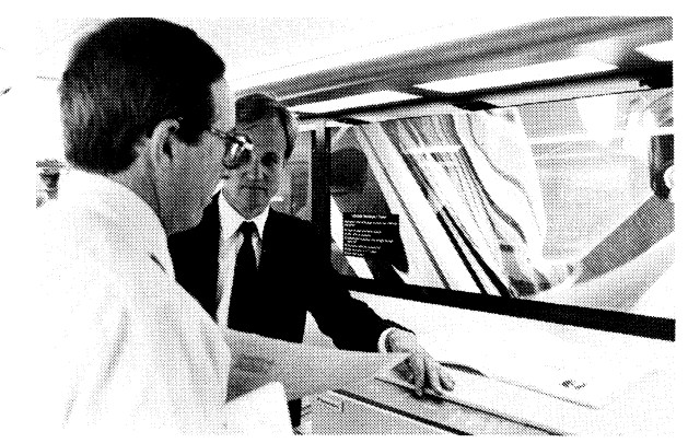
Data General employees had the opportunity to view the latest in printer technology on the Dataproducts van, which visited Data General-Westboro this week as part of their 1985 roadshow across the U.S. On display was their latest in band, matrix, Daisywheel, and laser non-impact printer technology.