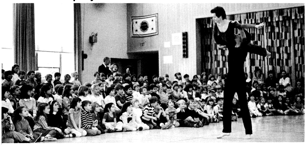
Students at the Mary Finn School in Southboro were entertained last week by the Concert Dance Company of Boston. The arts and enrichment program entitled "You Call That Dancing?" was sponsored by Data General, a supporter of the arts in area communities. The students experienced and became involved in the performance while learning from the artists about the creative process.