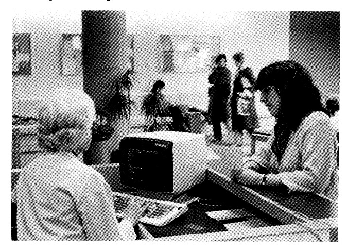
Data General recently donated an ECLIPSE MV/8000 II computer system and associated peripherals to the Framingham Union Hospital. The hospital information system enhances the quality of health care as it reduces costs and time spent in providing patient services.

Patients at the Framingham Union Hospital are registered or admitted more quickly and efficiently, thanks to a hospital information system recently donated by Data General. The computer system, valued at $250,000, is helping to improve the quality of health care as it reduces cost and time spent in providing patient services.