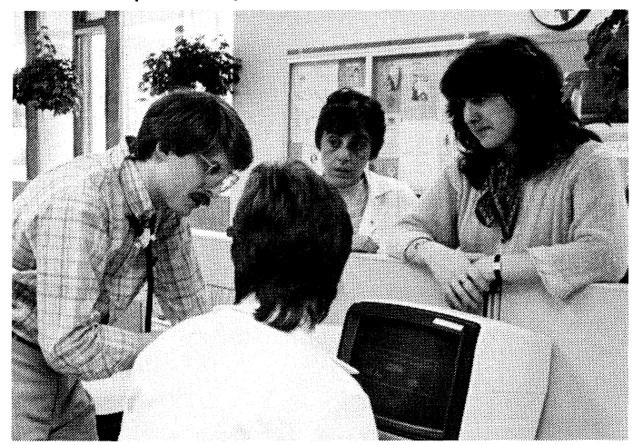
A doctor at the Framingham Union Hospital reviews a patients medical records via a Data General DASHER D210 terminal.

The Data General equipment is the first step in project to fully automate the operation of the hospital from patient admission to release which is expected to be completed by 1986.