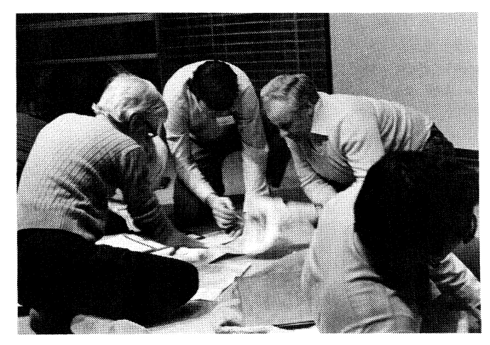
Attendees at the Customer Documentation Conference participate in a team-building project, sponsored by Management and Organizational Development.

Nearly 100 Documentation professionals from Data General facilities in Atlanta, Georgia; Austin, Texas; Cambridge, Southboro and Westboro, Massachusetts; and Research Triangle Park, North Carolina gathered at the Field Engineering Training Center in Woodstock, Connecticut early this month for the Customer Documentation Conference. The conference marked the first time that members of customer documentation groups from throughout the country had come together in one place.