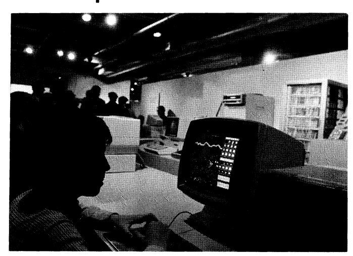
Saturday, February 23, is Data General Day at the Computer Museum.

Saturday, February 23, the Computer Museum, in its new home at Museum Wharf in Boston, will welcome Data General employees and guests. Admission is free. Just show your badge and walk in. Hours are 11 a.m. to 6 p.m.