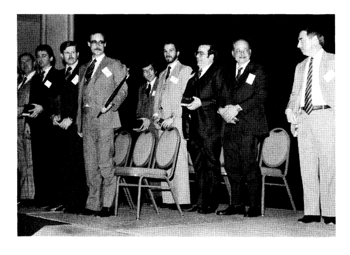
Here they are - the "Superstars of 1984".