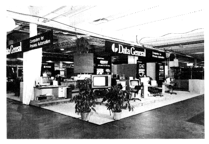
More than 35,000 people attended the annual Instrument Society of America show held late last month in Houston, Texas. Featured at Data General's booth was the DATA GENERAL / One Personal System, among other industrial instrumentation products.

In keeping with the theme, "Moving Industry Ahead in Process Automation," Data General demonstrated a wide range of computer products for the industrial instrumentation and process control marketplace at the annual Instrument Society of American show held October 22 in Houston, Texas.