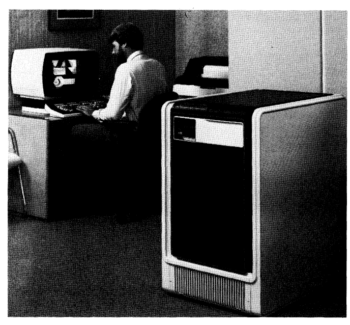
The ECLIPSE MV/8000 C computer is a compact package with the power of the larger ECLIPSE MV/8000 II computer system.

Data General has introduced the computer industry's first 32-bit computer based on high density 256K-bit dynamic random access memory (DRAM) technology.