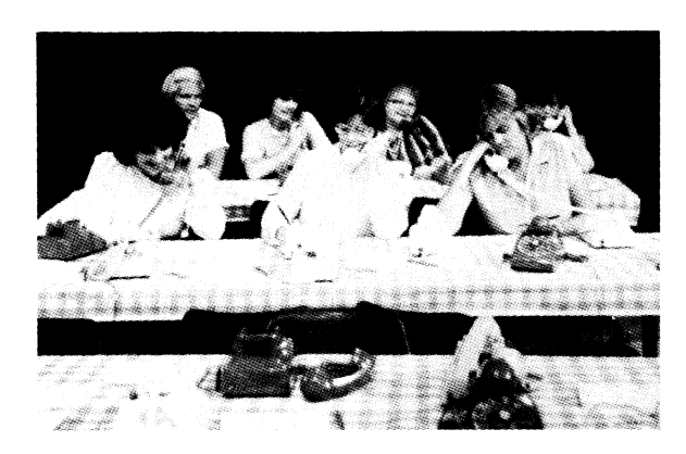
Nearly 40 Data General employees from Milford, Southboro, Wellesley, Westboro and Woburn were in Boston on Tuesday night to help viewer-sponsored Channel 2 raise funds in pledges to pay for operational expenses. This is the third straight year Data General employees have volunteered their time to answer phones during a WGBH Pledge Night period.