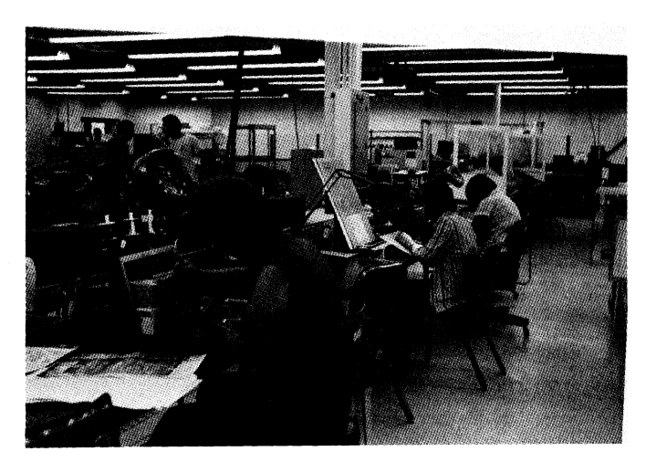
The new Manufacturing area in Special Systems' Building 6 offers expanded capability for Assembly and Test personnel.

Special Systems is "Together At Last" in its newly-remodeled Building 6 facility in Southboro. The Manufacturing, Assembly and Test areas, formerly in Building 4, have joined the Administration and Marketing areas of the organization which were already situated in Building 6.