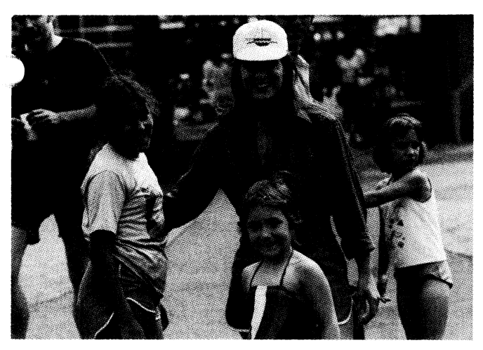
Smiling faces were the order of the day during Data General's annual visit to Rocky Point Park.