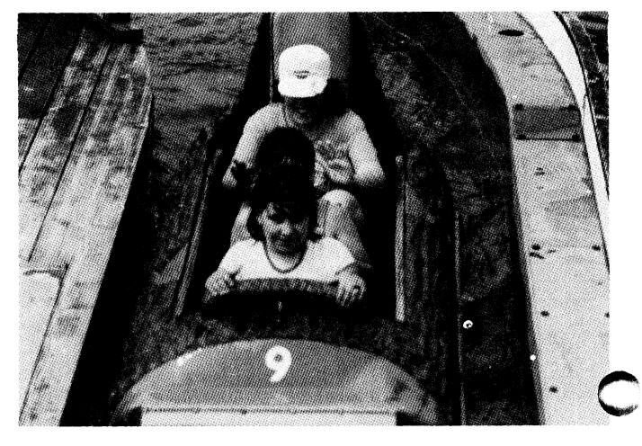
Cooling Flume rides turned to "cold" Flume rides as evening settled in at Rocky Point.

Data General's second outing of the summer season attracted more than 3,000 people to Rocky Point Park in Warwick Neck, Rhode Island. Ideal weather conditions seemed to bring families out early and encouraged them to stay late. The next outing takes place tomorrow in Boston at Fenway Park.