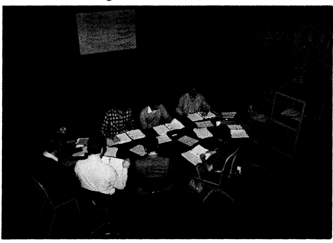
Central New England College students and Course Development and Media Products employees participate in a roundtable discussion evaluating a self-study course.

Lillian says the students bring a fresh perspective to the courses, as would first-time customers receiving training. New employees also participate in the course evaluations. Those selected have backgrounds similar to the customers who will receive the training.