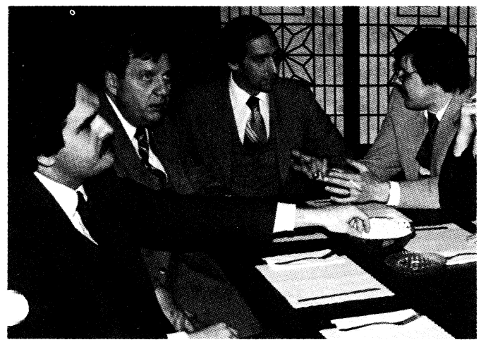
Manufacturing and Sales team up once again to sum up the week long training program.

The sales representatives agreed that understanding the process of building computers adds to their ability to sell. The learning was double edged, as the Southboro managers discovered that a lot of skill goes into selling products.