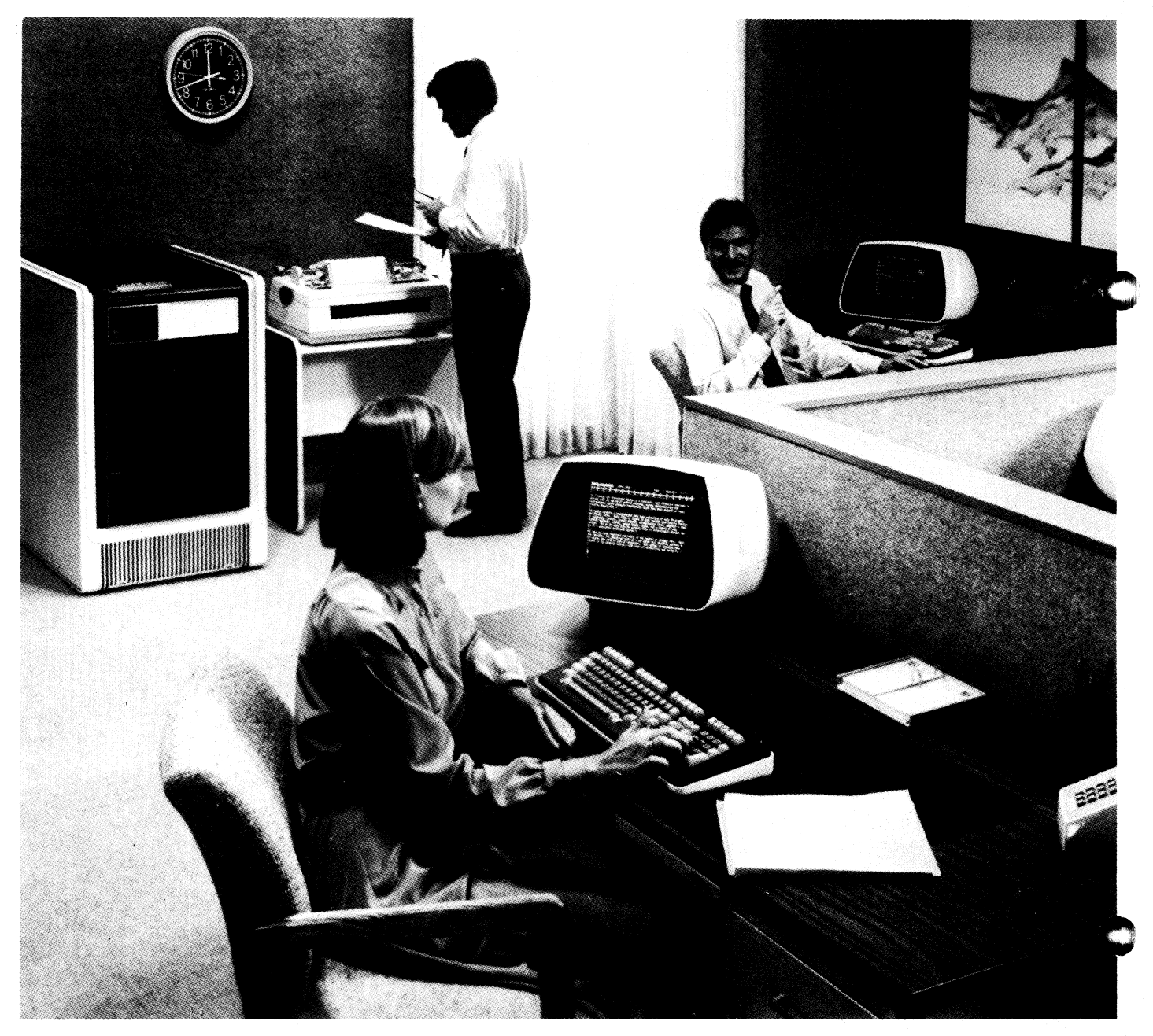
In 1982, Data General's 32-bit product line was broadened with the introduction of the ECLIPSE MV/4000 computer.

Our outlook for the remainder of 1983 is one of extreme caution about demand and economic conditions, but increasing confidence in our own resource and competitive position. We have no evidence of sustained improvements in order rates overall, although many of our newer products are doing well. As one company, our greatest contribution to the world's economic health will be to keep on schedule with our 1983 new product calendar. Thank You.