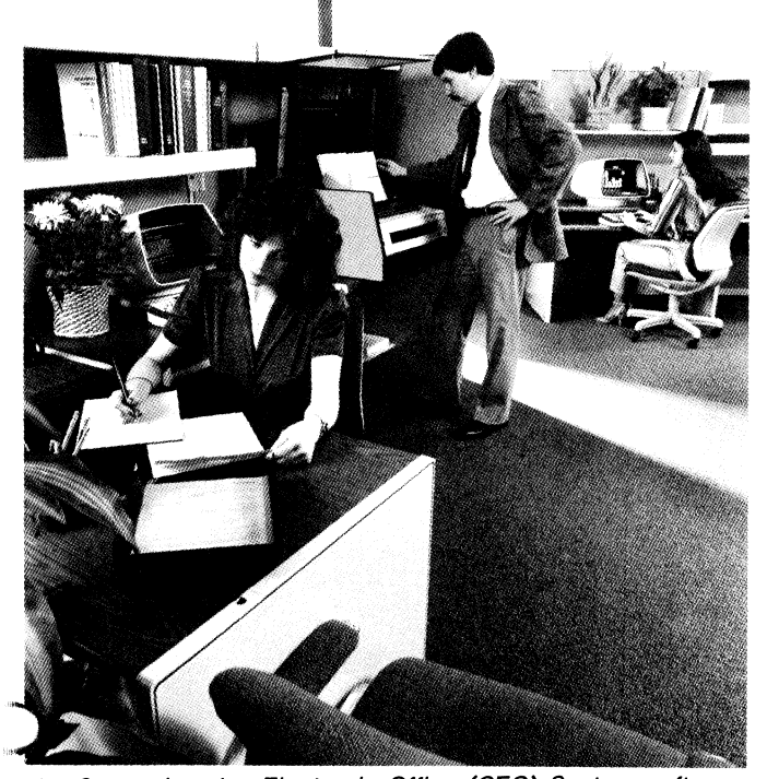
The Comprehensive Electronic Office (CEO) System software has shown strong early acceptance in a highly competitive market. Customers are finding it can significantly help increase office productivity.

In 1982, Nippon•Data General became part of the Data General family when we increased our ownership of the Japanese firm to 85 percent. Today, we routinely exchange people, technology and business practices. We in the United States are learning from Nippon•Data General at the same time that we are haring with them. This organization is totally Japanese in management and organization and through it we have access to the growing markets of Japan and the Far East.