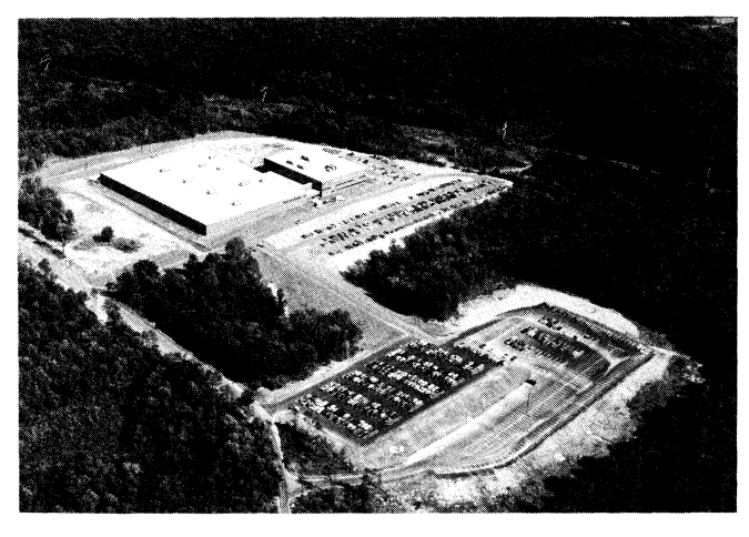
"We're Up And Running" is the theme for Data General-Milford's first employee Open House. Pictured is an aerial view of the Milford facility which has been occupied by employees since February of this year.

"4,3,2,1..." And the "blast-off" part of the countdown for Data General-Milford's first Field Engineering Open House will happen tomorrow, Saturday, September 25, from 11 a.m. to 3 p.m.