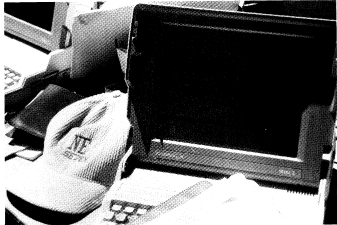
DATA GENERAL/One Model 2 portable computers sit atop a folding table in the sun of Woods Hole during preparations for WNEV-TV's live news broadcasts, the final stop in the Boston station's five-week news tour throughout New England.

connections, huge satellite equipment and mobile video control booths. "People were impressed. They hadn't seen anything like it."