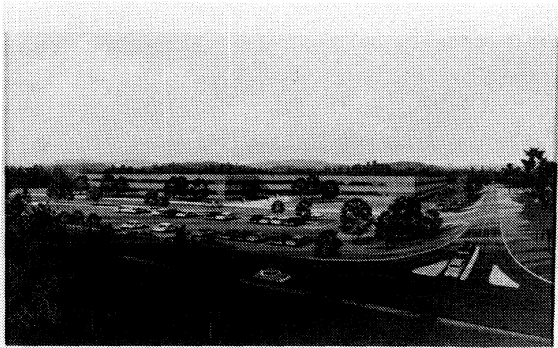
Data General Corporation